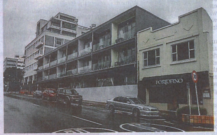
Before and after: Two old buildings on Gill St, near Centre City Shopping Centre, were demolished to make way for the Metrotel, which opens soon.