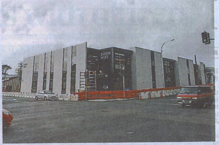
Before and after: Kibbys Metal Pressing on Devon St West and Dawson St has been replaced by Dawson House, which opens today.